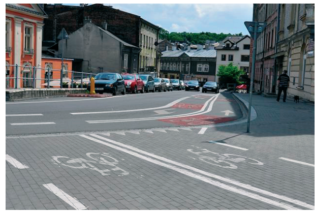
Fig. 5. Two-lane bike path, Krakow, Poland.