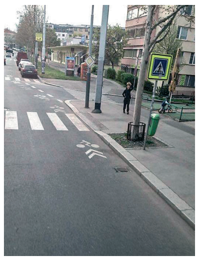
Fig. 4. Bike path on the street, Prague, Czech Republic.