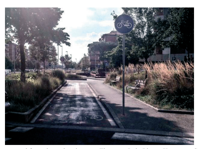
Fig. 6. Bike path, separated from the pedestrian one, Florence, Italy