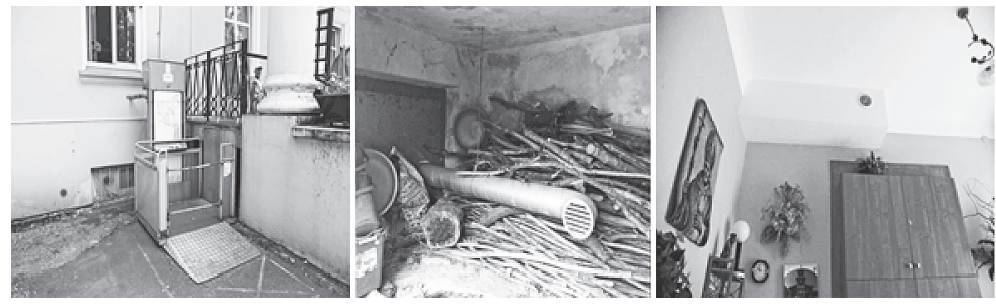
Fig. 4. The secondary solutions aimed at improvement of living conditions and functionality of the building. From left: the elevator beside the main entrance, mechanical installation under the terrace of the garden, ventilation grill inside the building.