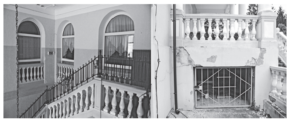
Fig. 3. The security features on the staircases and the space under the stairs to terrace from the side of the garden.

Within the frameworks of the adaptation of the building to the needs of a social welfare home, the minor changes were also introduced. Mechanical ventilation devices on underground floor were put in the kitchen and laundry windows and under the terrace from the side of the garden (Fig. 4). Another secondary element is the elevator beside the main entrance, which facilitates the mobility of the wheelchairs users (Fig. 4). The palace in Krzesimów, among the many other historical buildings, was one the examples of the situation where introduction of spatial and functional changes was inevitable to fulfil its designated function. The basic design problem, which had to be solved taking into consideration numerous factors and regulations, was to adapt historical elements to meet the requirements of the patients with various types and level of disability.