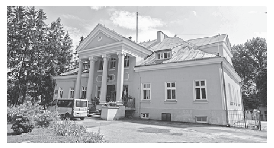
Fig. 1. The front façade of the palace in Krzesimów

This area was entered into the register of monuments "as the example of the spatial layout from the 19th century on the basis of the original complex, of well preserved composition and stand, of historical, esthetical, natural and ecological value." [6]. The palace-park complex in Krzesimów comprising the historical ponds is situated on the hill bordering from the west with a river. The first records of Krzesimów date back to 1409. Well-preserved 19th century palace was erected by the former owners of the lands, the Stamirowski family. The palace is two-storey, brick building in the classicist style (Fig. 1). The complex consists of an annex (which was built in the first half of the 19th century just like the palace) and such buildings as labourer quarters, two barns, a garner and a hops drying room.